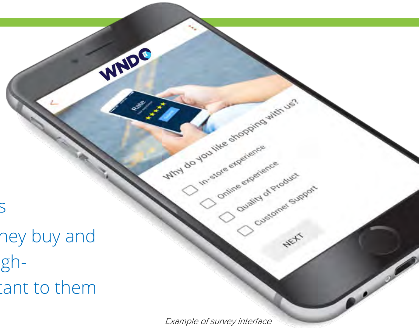
Example of survey interface